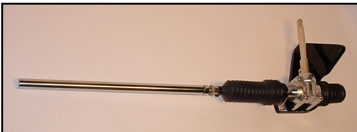
8000470-01 (shown above with Vega Replacement Shaft)

Due to variables outside our control these kits may not fit all applications. Also, please verify kit will fit your application before altering vehicle.